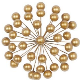
Foam Starburst Wall Art